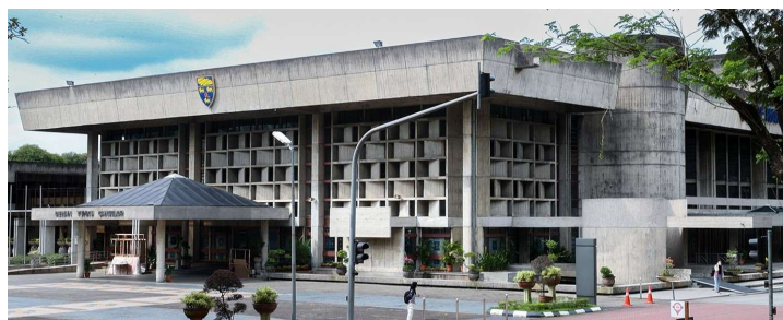
The Dewan Tunku Canselor building at Universiti Malaya