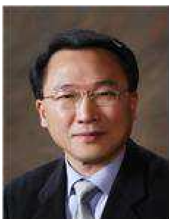
Bang Hanam, Minister of the Employment and Labor, Korea

I extend my heartiest congratulations for the opening of the 2013 Asia Career Development Association International Conference in Korea.